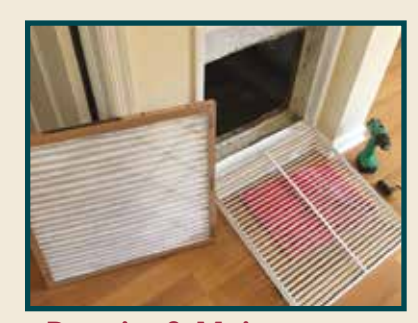
Repairs & Maintenance